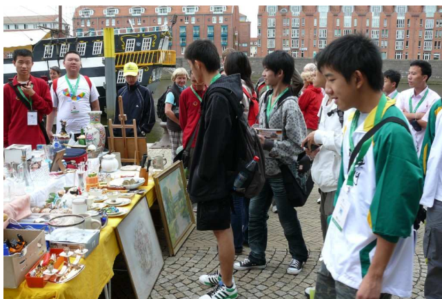
Flea market at the Schlachte

So in the final, Ireland/Georgia/Bangladesh/Zimbabwe will play Brazil/Mexico/Honduras/Chile. Kick-off Sunday, 20:00.