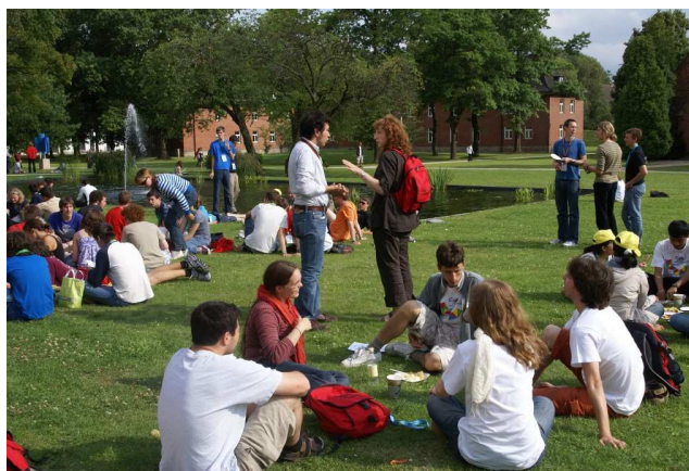
At the barbecue