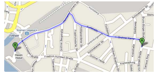
From the main gate to the Haven Höövt shopping mall

Back on campus Team photographs in the Campus Center